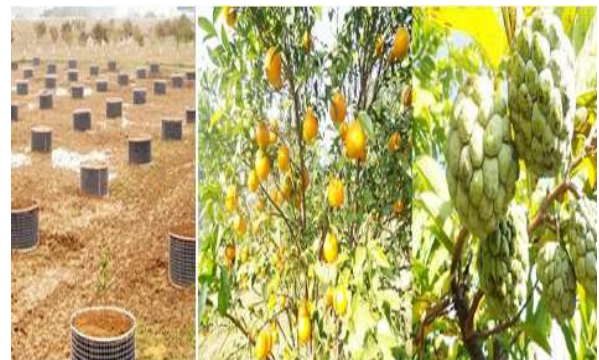
Faculty of Horticulture & Forestry