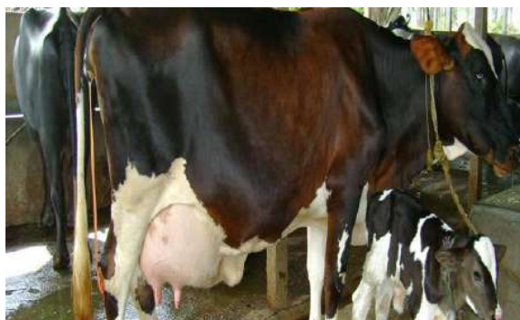
Faculty of Dairy Technology