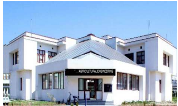
Faculty of Agricultural Engineering

The University has highly structured infrastructure facilities in terms of buildings, laboratories, lecture rooms, instructional and research farms, modern instruments/equipments, farm machinery, transport and library facilities. It has distinguished and qualified faculty positioned at all the campuses and regional research stations. The faculty members and the post-graduate students of the University have won numerous national and international recognitions in the forms of awards, honours and fellowships awarded by the prestigious professional scientific bodies/societies.