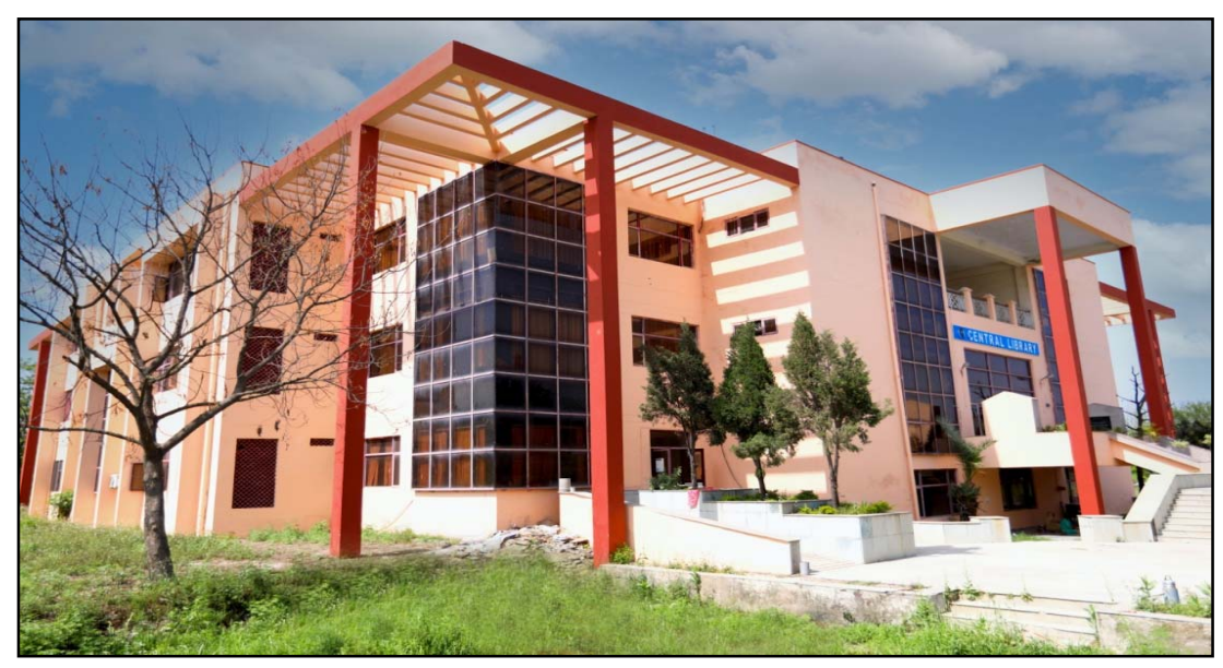
Central Library, Chatha