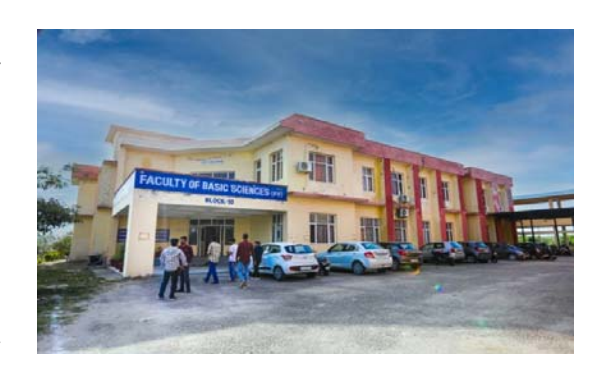
Faculty of Basic Sciences