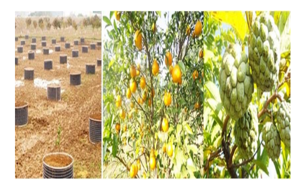
Faculty of Horticulture & Forestry