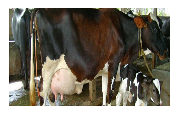
Faculty of Dairy Technology